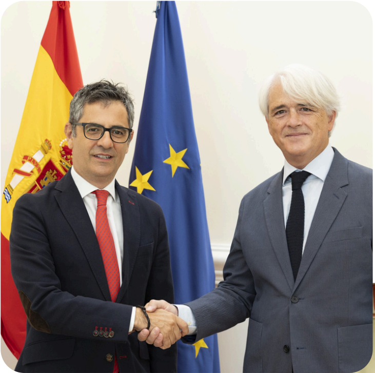
With the Ministry of Justice

INSTITUTIONAL dialogue and cooperation of the profession