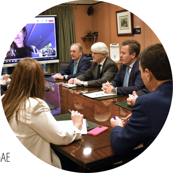
Joint Commission CGPJ-CGAE

New stage in the collaboration with the COUNCIL OF THE JUDICIARY