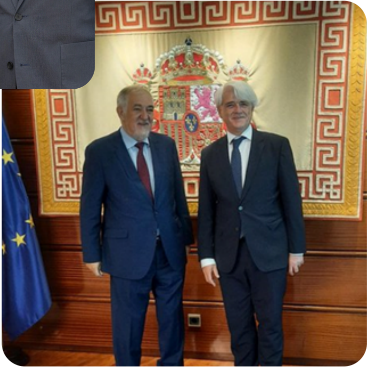
With the Constitutional Court